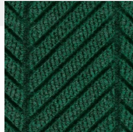
172 Southern Pine