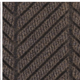
175 Chestnut Brown