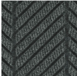
170 Black Smoke