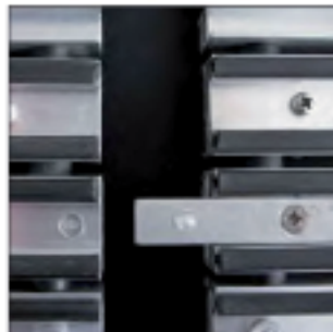
connectors for profile length – bottom view