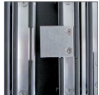
connectors for walking direction – bottom view

It is recommended by the manufacturer to share the entrance mats in the walking direction if possible. Examples of correct and wrong dividing: